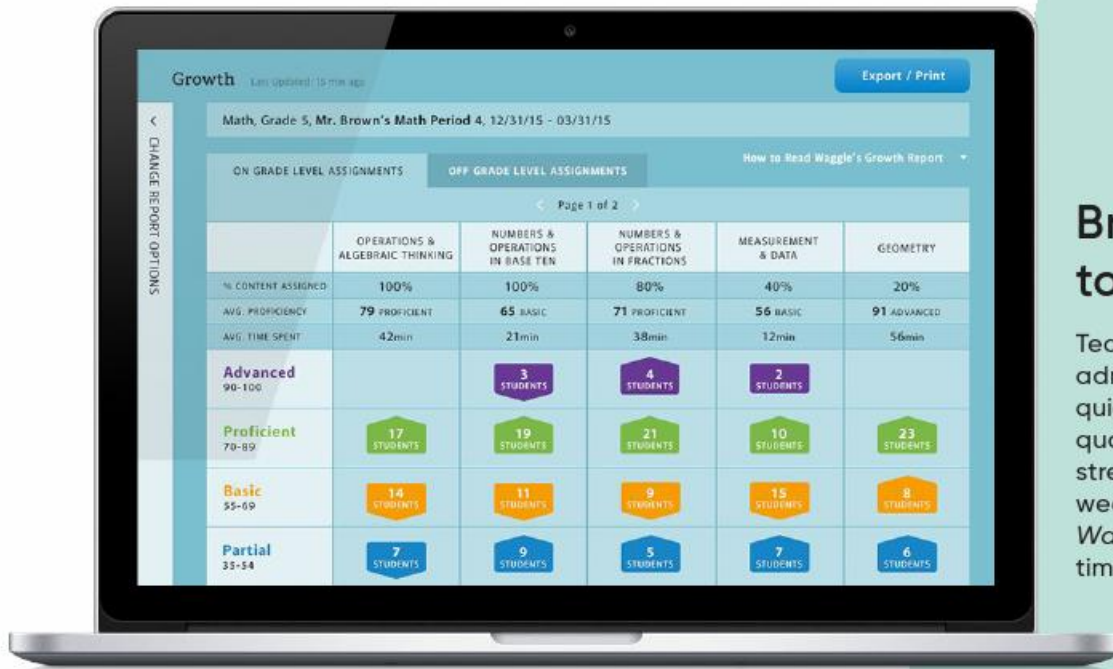
Waggle Growth Report